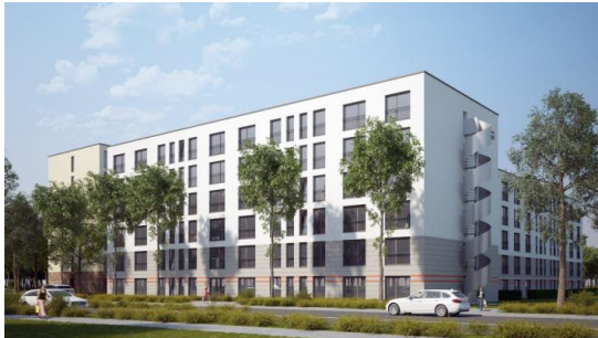
Building from outside