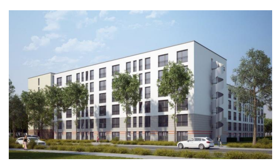
Building from outside